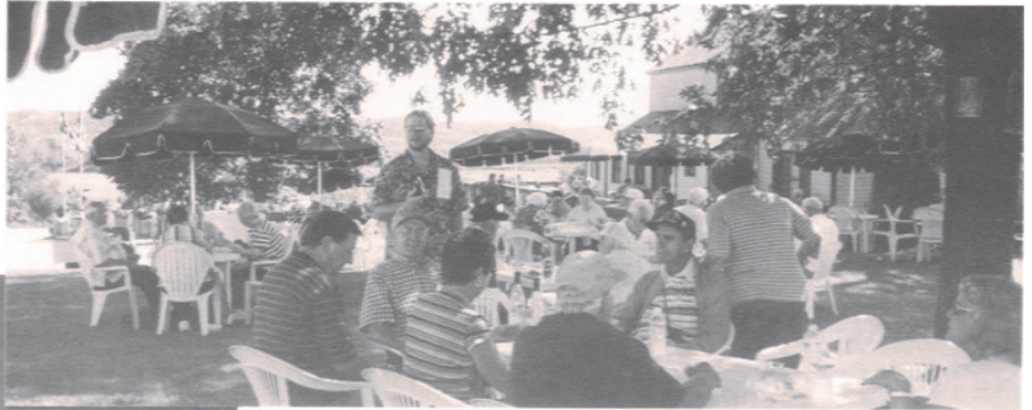
Sugar Creek Winery