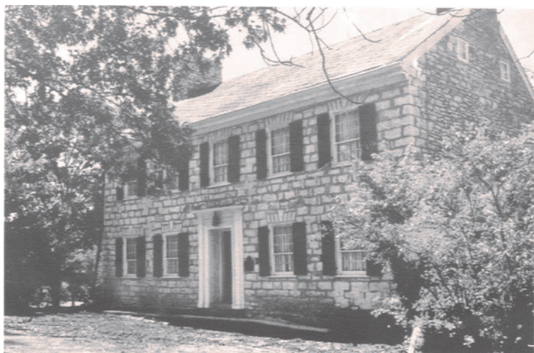
The Daniel Boone Home