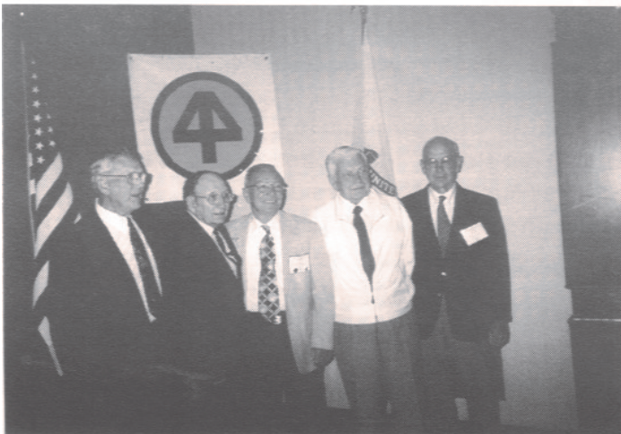
Co. L, 71st Regt.