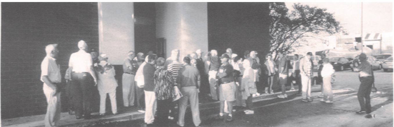
Waiting for our tour bus

On our tour we ended up with a few lunches short when we got to the winery. Blame that on me because when we had a few seats open on the bus, several people said that they would go along. I forgot that the lunches were already totaled up the day before. The owner of the winery put himself out by going into town (Defiance) and getting us enough lunches. Sorry that we didn't get to inspect the winery and taste some of the wine and buy some, but we were running late because of the bus snafu. It was supposed to be in the front of the hotel at 7:30 but it went around to the back of the hotel while we waited at the front.