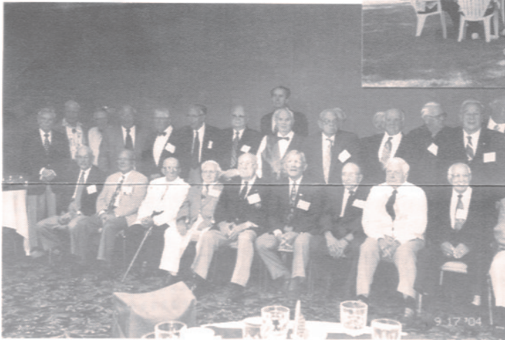
44 th Infantry Division