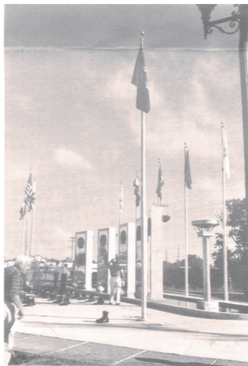
War Memorial (note the boots)